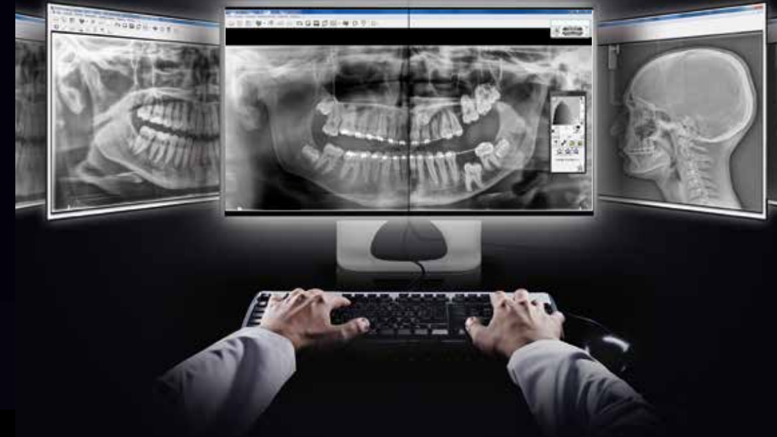
CS 8100 3D

CS ADAPT IS AVAILABLE FOR ALL CARESTREAM DENTAL EXTRAORAL IMAGING SYSTEMS*