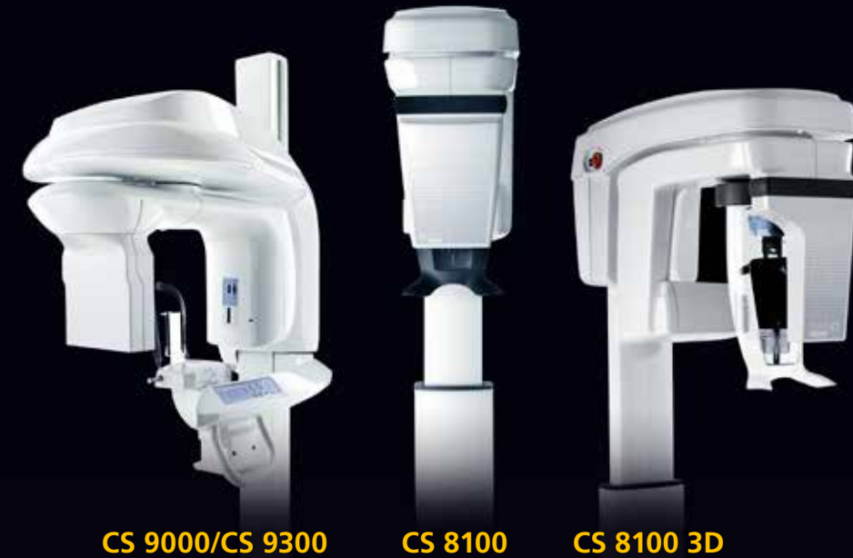
CS 9000/CS 9300